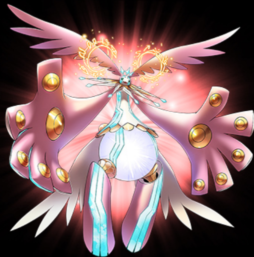
ケルビモン (善) (X抗体)

" Two of the Three Great Angels! I'm certainly glad to have you on my side!"